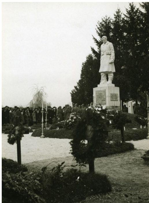
Inauguration of the Monument to the Fallen Soldiers of the 17 th Infantry Regiment , designed by Svetoslav Peruzzi and Lojze Dolinar, in 1923 at the Ljubljana cemetery; courtesy of: Museum of Contemporary History of Slovenia ( Slovenec Archive )