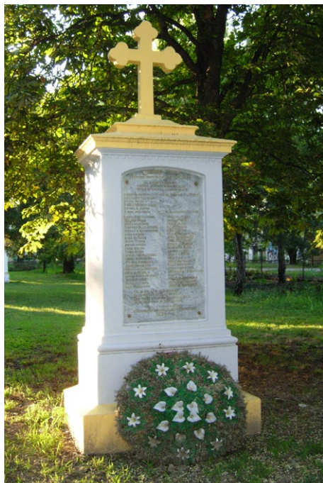
Author unknown, Monument to the Kovilj Volunteers , 1924, Kovilj, Serbia