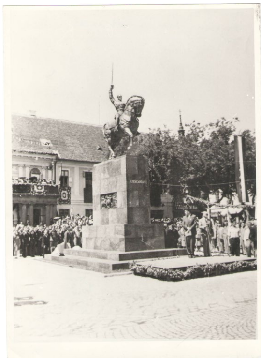
Inauguration of the monument to King Alexander I by Antun Augustinčić in Sombor in 1940; courtesy of: City Museum Sombor, Serbia

Postcard issued on the occasion of the inauguration of the monument to King Alexander I by Antun Augustinčić in Sombor in 1940; courtesy of: City Museum Sombor, Serbia