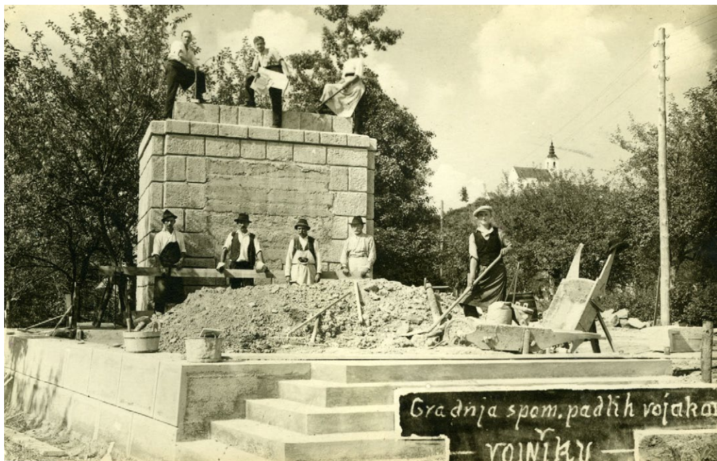
Construction of the monument to the fallen soldiers in Vojnik, Slovenia (finished in 1920)