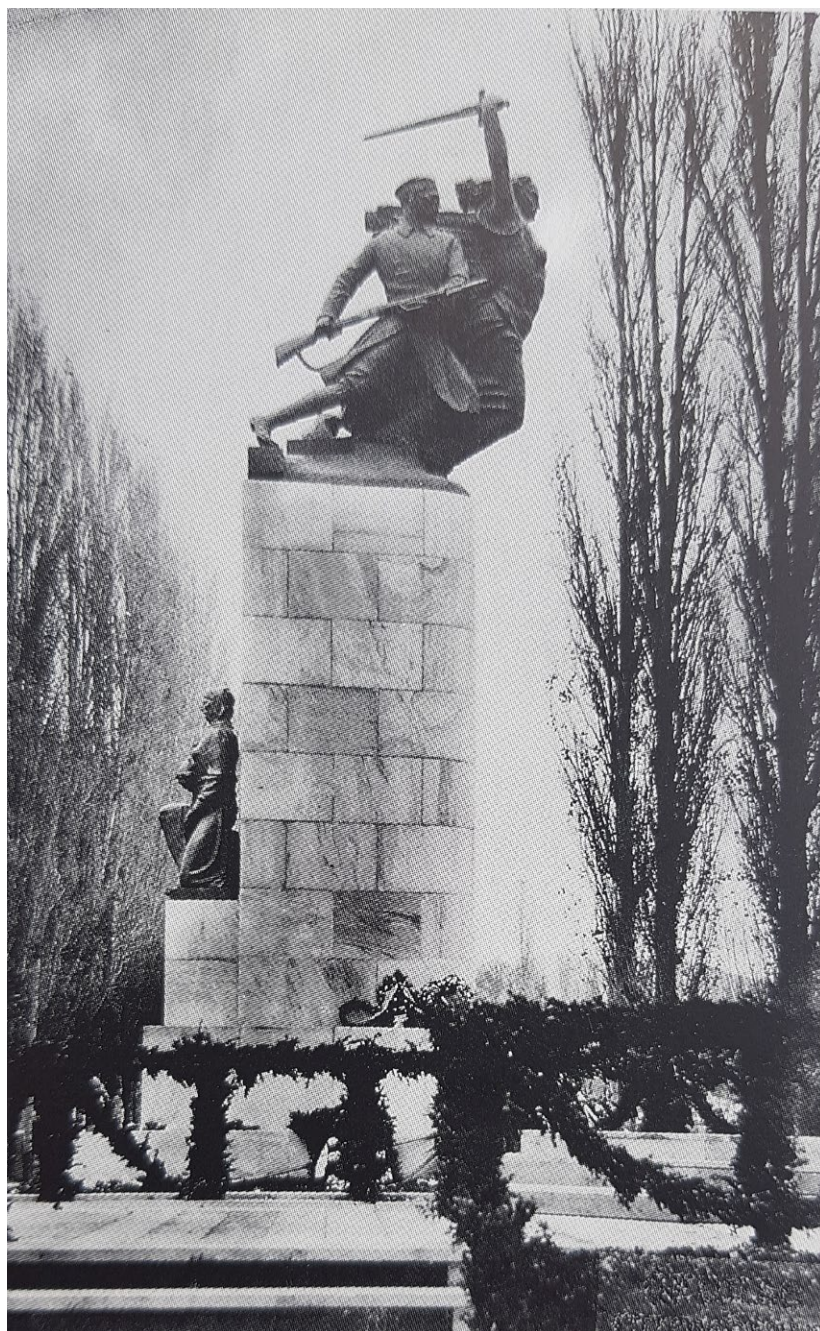
Lojze Dolinar, Monument to the Fallen Student Combattants , 1935, destroyed, Skopje, Macedonia