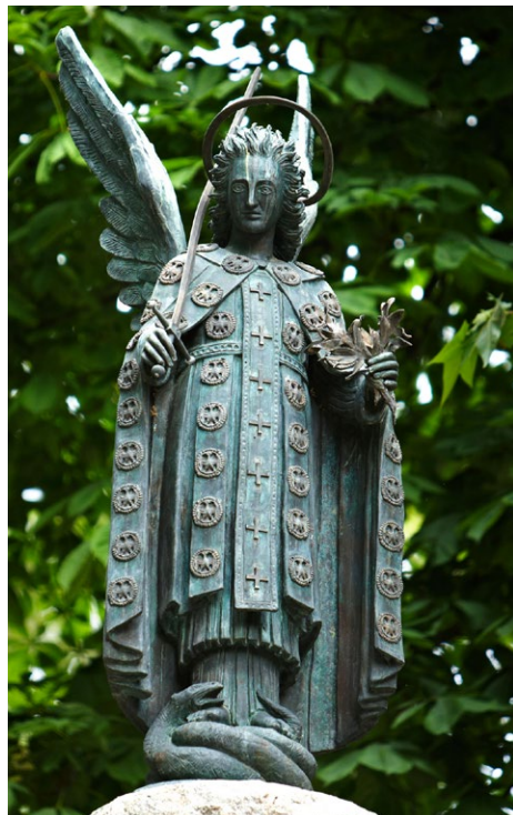
Jovan Dučić, Angel on the monument To the Heroes for Freedom , 1938, Trebinje Town Square, Trebinje, Bosnia and Herzegovina; courtesy of: Tourist Organization of Trebinje