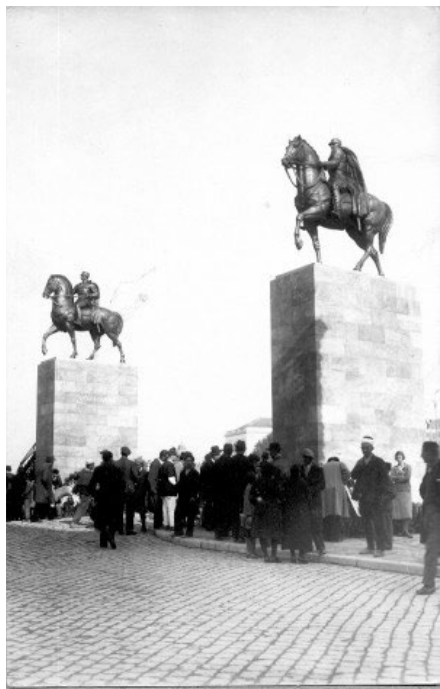
Anton Augustinčić, Monument to King Peter and King Alexander Karadjordjevic , 1937, destroyed, Skopje, Macedonia

King Alexander and Queen Marija, wearing the national Slovene costume, at the inauguration of the monument to King Peter in Kranj in 1926