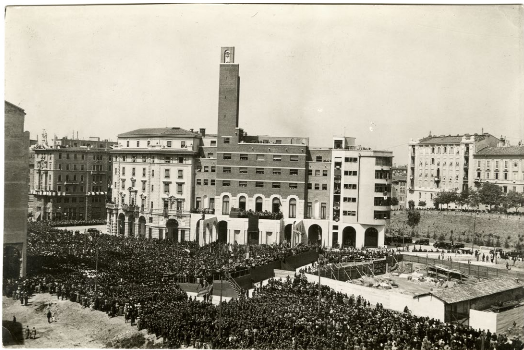
Crowds on the Oberdan Square in Trieste, Italy, in front of the Fighter House (Casa del combattente), designed by the architect Umberto Nordio, 1930s; courtesy of: Photo Archive of the Musei civici Trieste

Arduino Berlam, Victory Lighthouse , 1927, Trieste, Italy; courtesy of: Photo Archive of the Musei civici Trieste